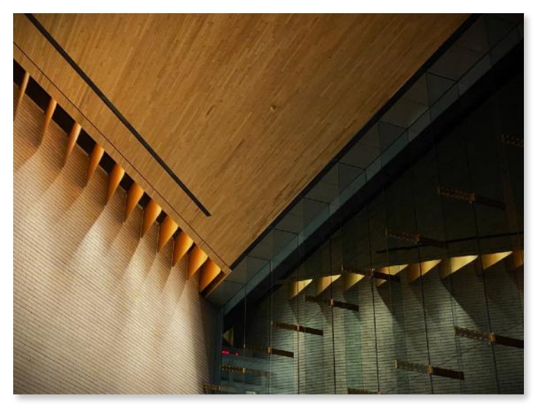
Abravanel Hall Lobby, SLC, UT