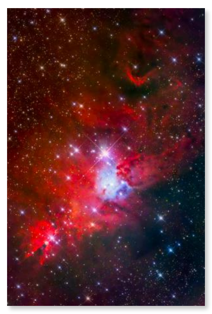
Christmas Star Cluster & Cone Nebula