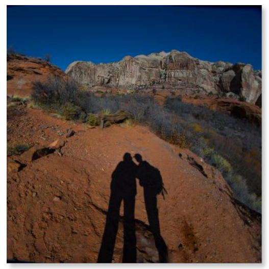
Shadows Calf Creek by Mary Whitesides

This Shutter Up Social will explore all the possible ways to photograph shadows. Long shadows, mysterious shadows, reflective shadows, creative shadows, etc. Put your imagination in gear and share all your interpretations of shadows.