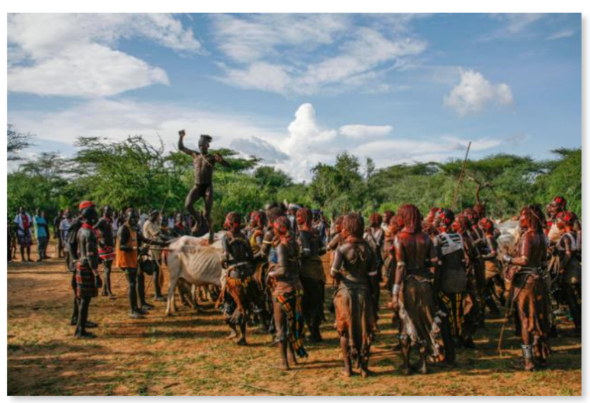
Rites of Passage in Ethiopia by Mary Whitesides

CLICK HERE to view images from past Shutter Up Socials