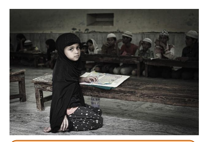
A Color image which is considerably desaturated of the Color content can be entered in Color Section