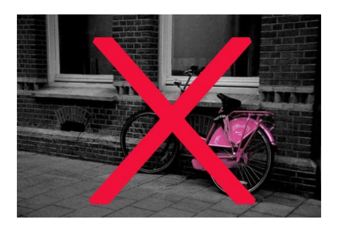
An image with gray scale, which has partial coloration is NOT eligible.