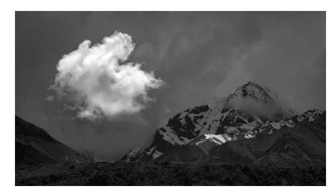
The same image in Monochrome should retain the same title; "The Lonely Cloud".

• Any format (horizontal / vertical) and any aspect ratio (3:2, 16:9, 1:1, etc.) can be submitted. But they should not exceed the maximum dimensions allowed by the competition rules.