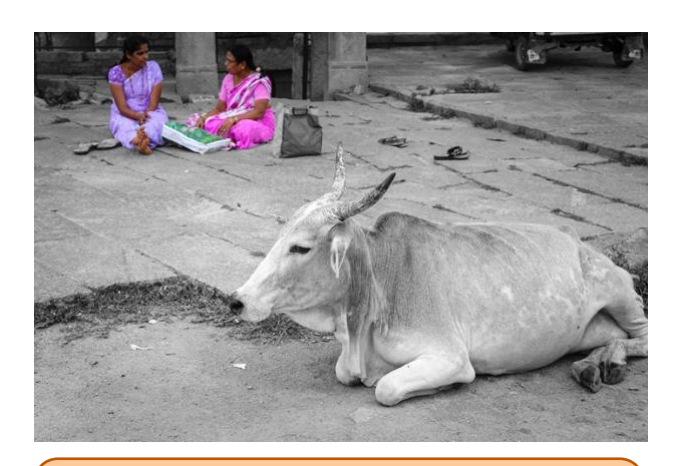
A gray scale image with an inclusion of Spot coloring is eligible for the Color Section