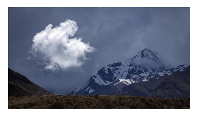
A color image given the title of "The Lonely Cloud"

• Color and Monochrome images from the same capture that share substantial pictorial content in common will be considered the same image and must be given the same title.