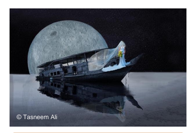
Altered Reality images with many layers blended and manipulated are eligible.