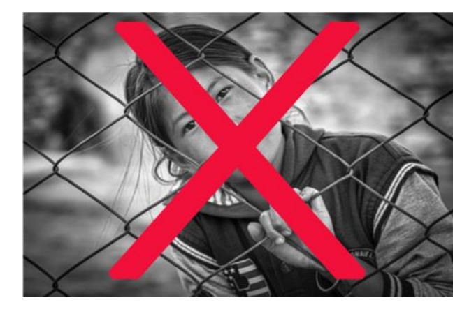
A Monochrome image is NOT eligible to be entered in the Color Open Section