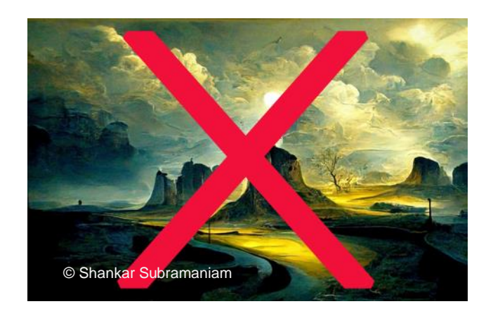
A CGI image generated through AI is NOT eligible for this Division.

• Color and Monochrome images from the same capture that share substantial pictorial content in common will be considered the same image and must be given the same title.