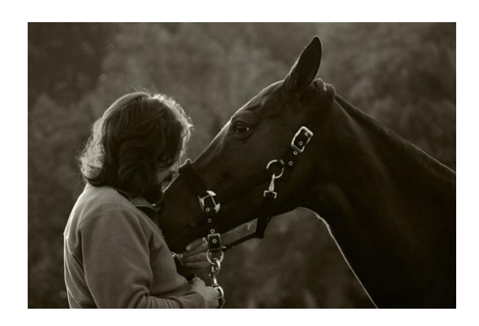
A gray scale image (Black and White tones) which is toned with one single color (like sepia, gold, etc.) is eligible as a Monochrome Image.