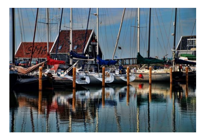
A Color Image is one which has an additional hue/color other than the gray scale which includes Black and White