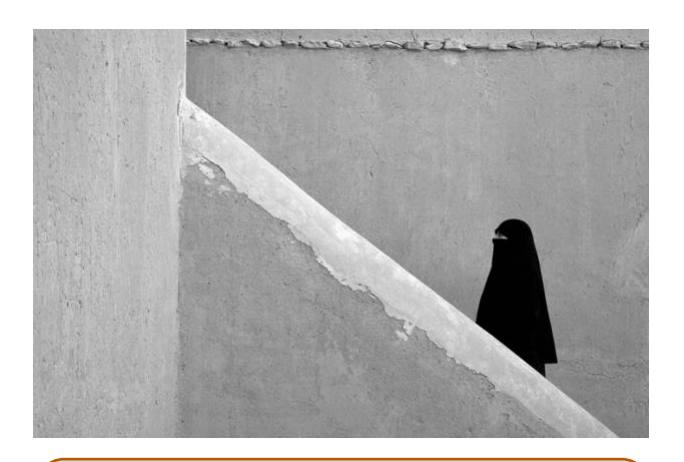
A Monochrome image with shades of gray including pure black and pure white.

A greyscale or multi-colored image modified or giving the impression of having been modified by partial toning, multi-toning or by the inclusion of spot coloring does not meet the definition of monochrome and shall be classified as a Color Work.