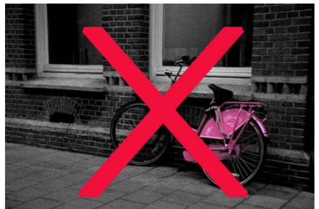
An image with gray scale, which has partial coloration is NOT eligible.