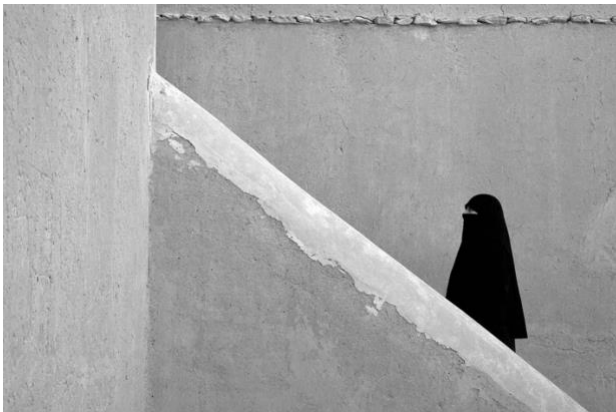
A Monochrome image with shades of gray including pure black and pure white.

A greyscale or multi-colored image modified or giving the impression of having been modified by partial toning, multi-toning or by the inclusion of spot coloring does not meet the definition of monochrome and shall be classified as a Color Work.