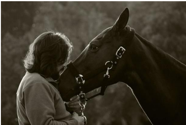
A gray scale image (Black and White tones) which is toned with one single color (like sepia, gold, etc.) is eligible as a Monochrome Image.